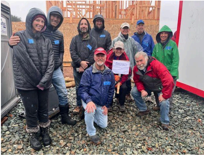
Build For Unity